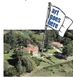
donations at any level will be accepted

Please join us at the Hui for a day of celebrating the arts sponsored by SOURCE. We are promoting the most exciting interactive-arts festival on Maui with a night of inspiring art proposals and day of giving back to the community with free workshops.