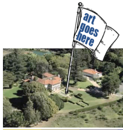
donations at any level will be accepted

Please join us at the Hui for a day of celebrating the arts sponsored by SOURCE. We are promoting the most exciting interactive-arts festival on Maui with a night of inspiring art proposals and day of giving back to the community with free workshops.