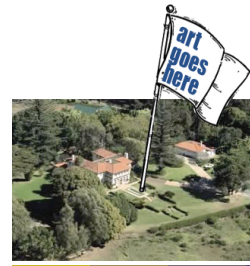
donations at any level will be accepted

Please join us at the Hui for a day of celebrating the arts sponsored by SOURCE. We are promoting the most exciting interactive-arts festival on Maui with a night of inspiring art proposals and day of giving back to the community with free workshops.